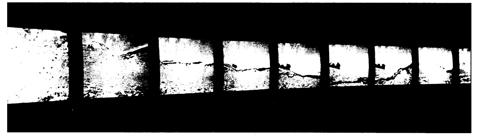
Andrej Zdravic, Water Waves.